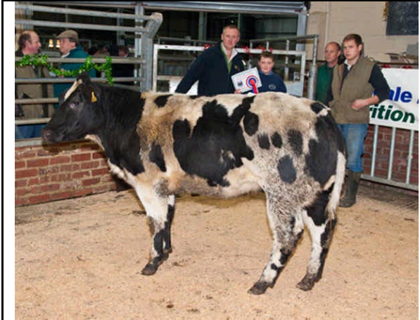
Champion Store Animal