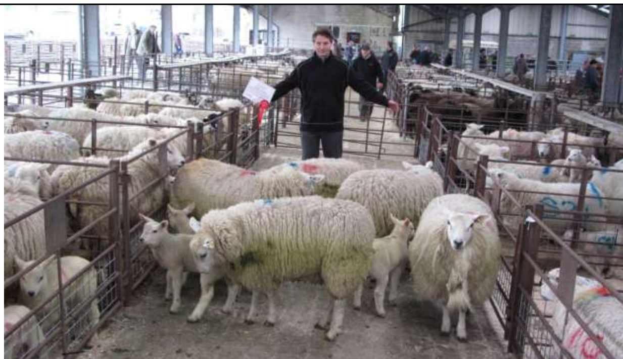
Best Continental Hoggs with Lambs 1 st KG Stapleton £232, 2 nd KG Stapleton £230, 3 rd SD Bennett £196